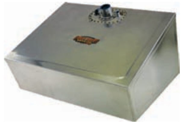
Off Road Series Truck Cells