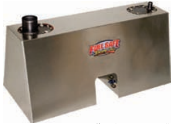
Off Road Series Buggy Cells

All off road cells are compatible with gasoline, diesel and E85 fuels. See the tables to the right for the cell that will fit your application.