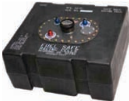
Race Safe Racing Cell®

NOTE: The RS100 Series is Race Safe without containers. See page 6 for description. Race Safe cells are not FIA certified.