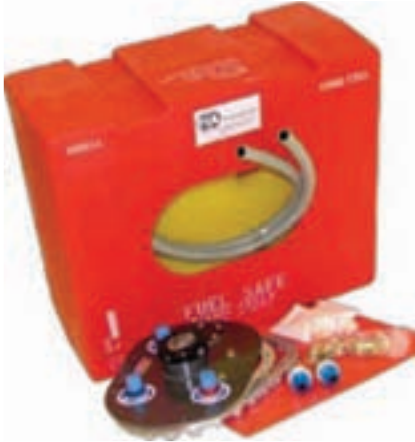
Core Cell™ Racing Cell